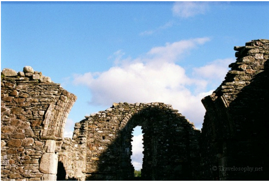
Cathedral Arches & Window

A Picture Journey of Glendalough Monastic Site , Co. Wicklow, Ireland, 06 Oct 2012.