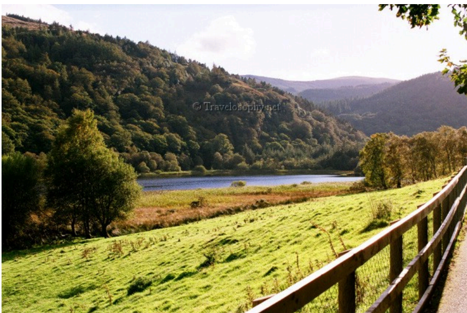
The Lower Lake and Valley