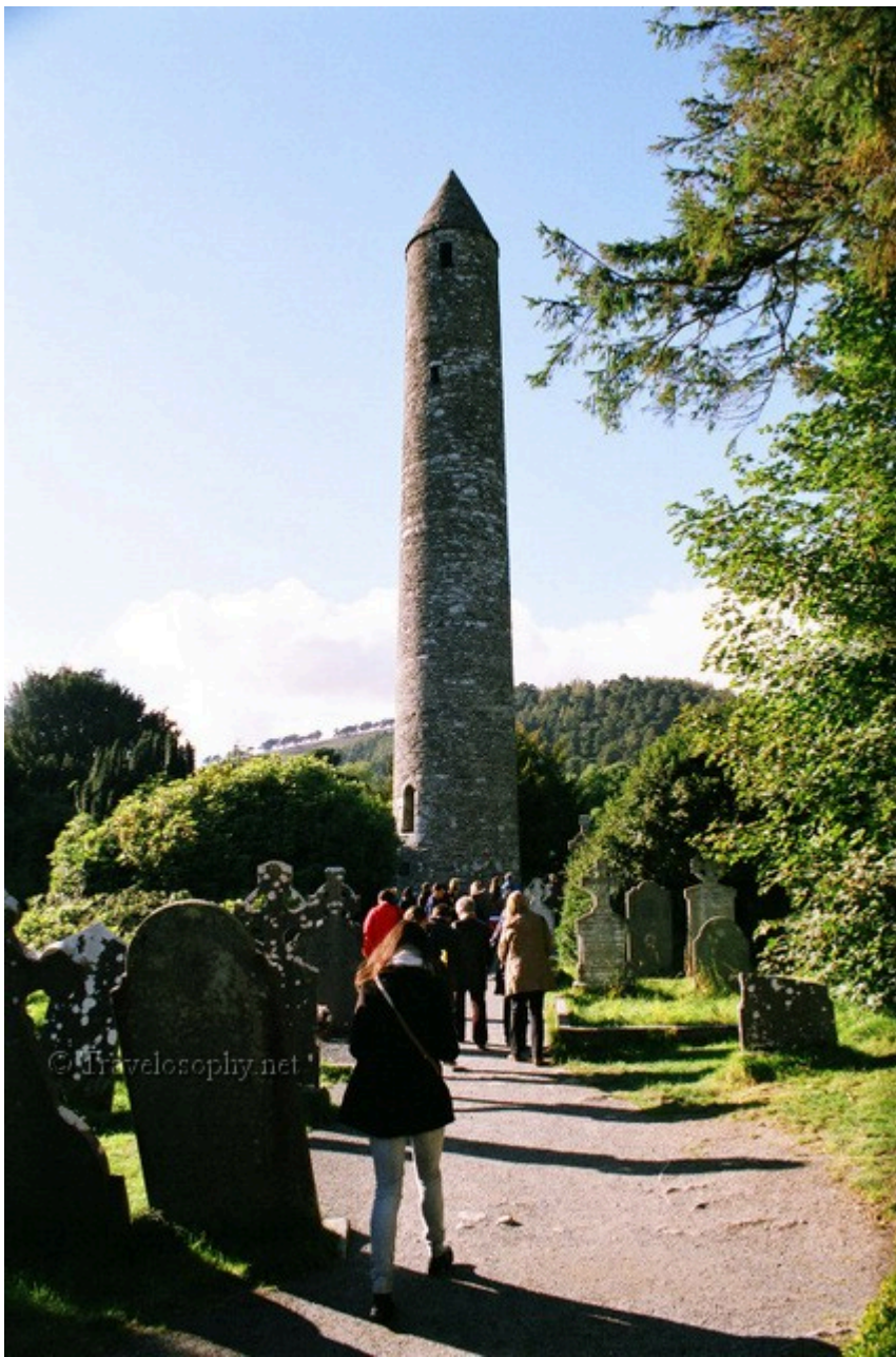
The Round Tower at Glendalough