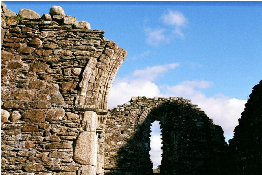
Cathedral Arch and Window