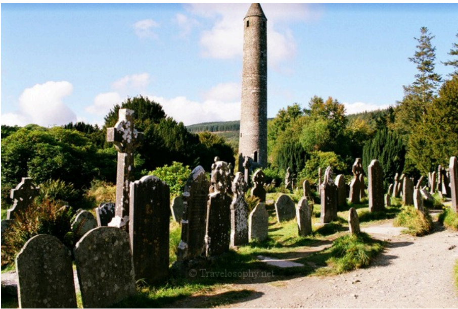
Glendalough Round Tower & Cemetery