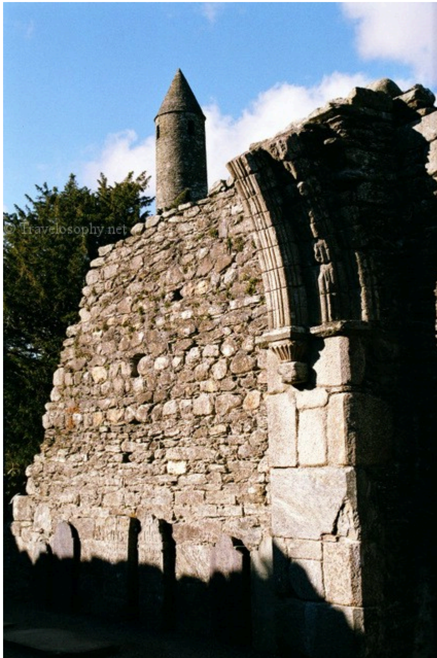
Arch, Wall & Tower