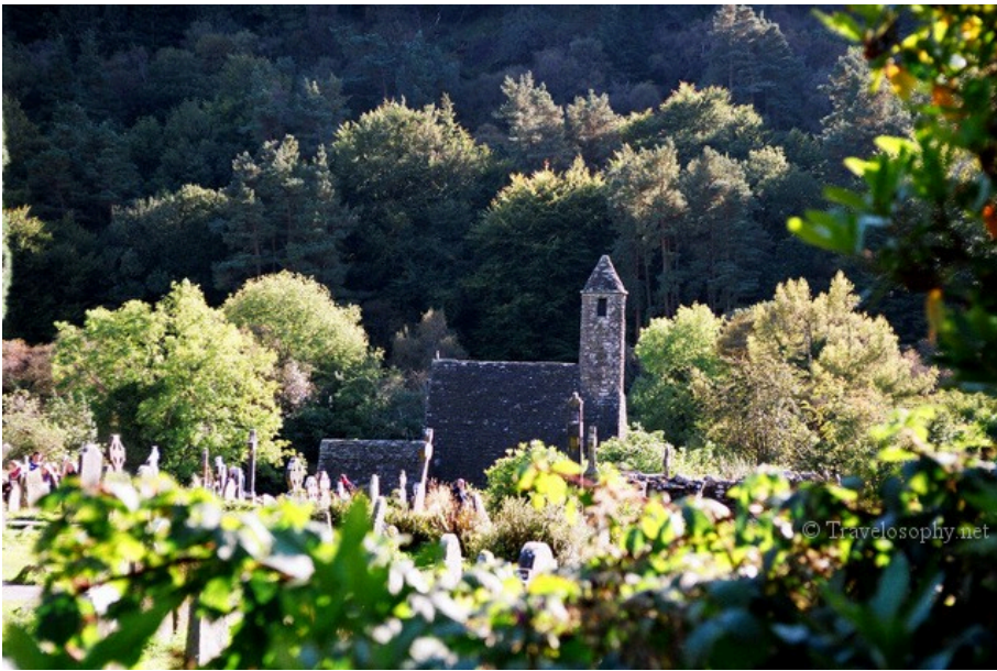
St Kevin's Church & Forrest – Glendalough