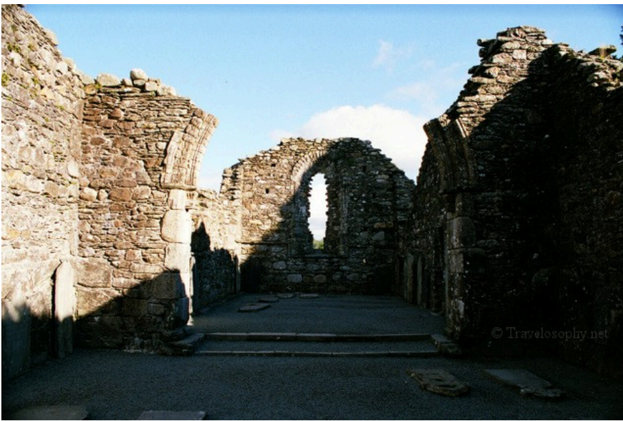
Cathedral Shadow and Light