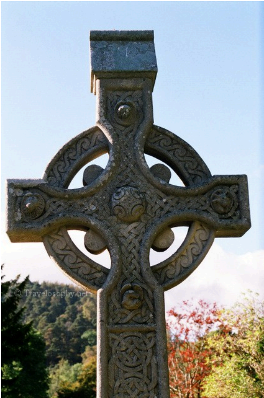
Celtic Cross Glendalough