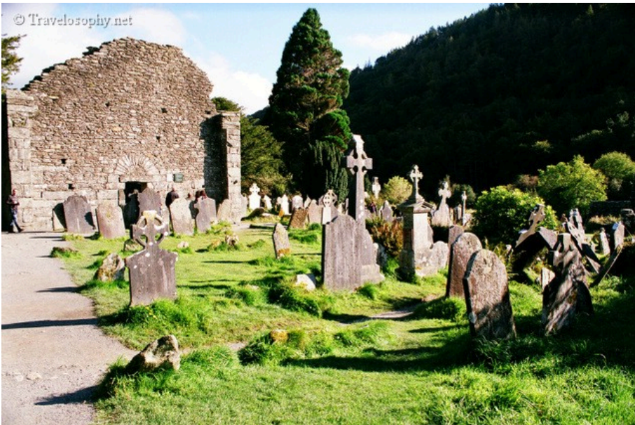
Glendalough Cathedral Cemetery