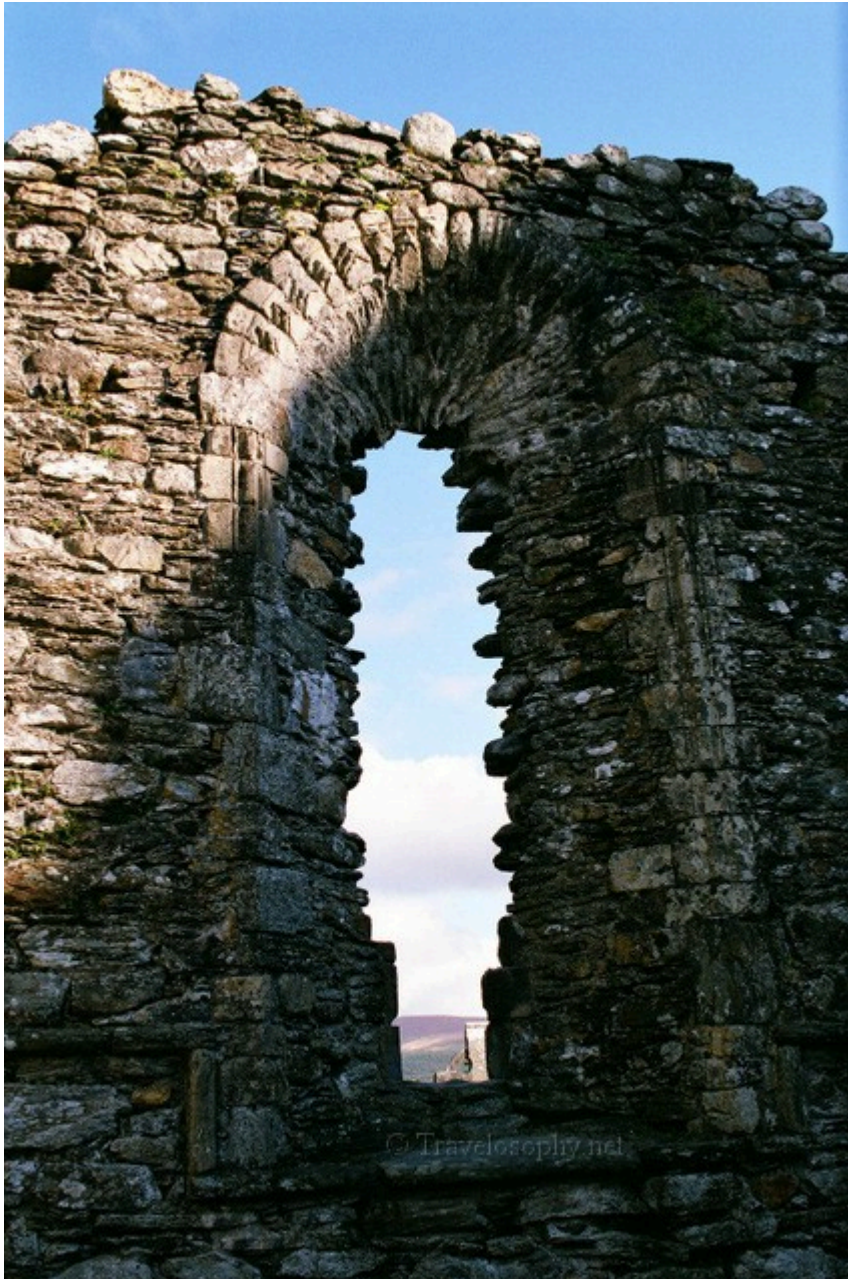
The Cathedral Window