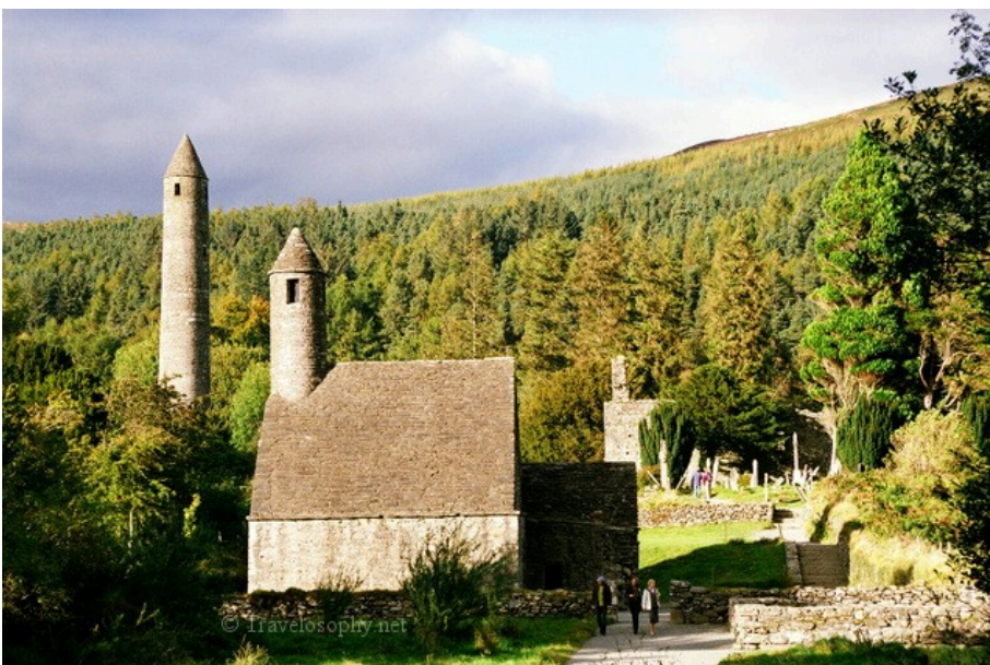
Saint Kevin's Church – Glendalough