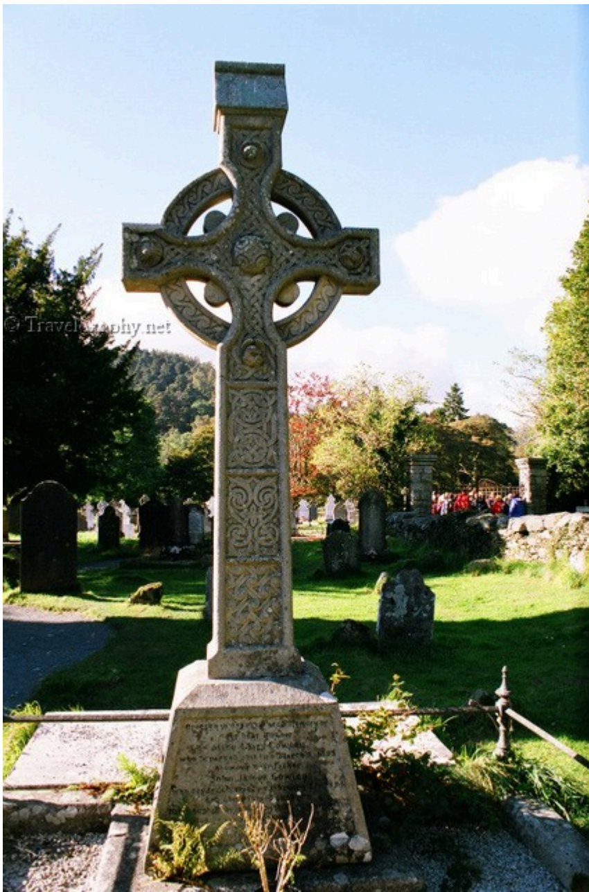
Celtic High Cross at Glendalough