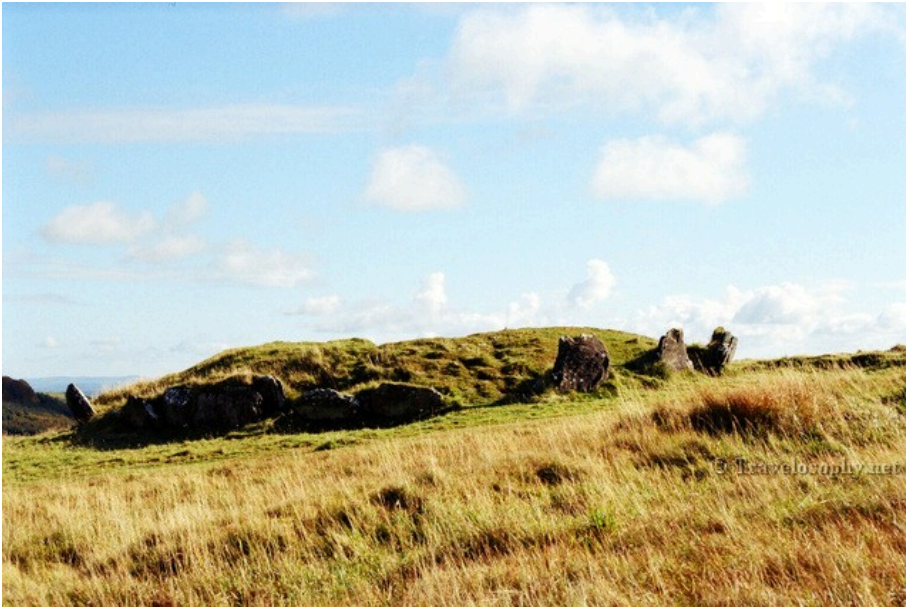
Cairn U – Loughcrew