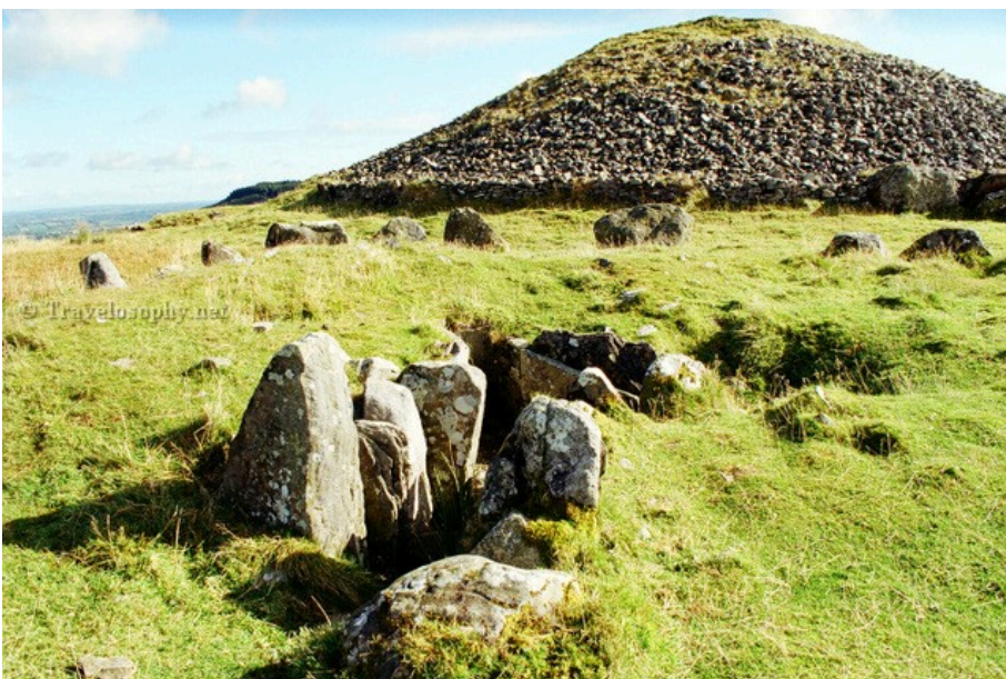
Loughcrew – (Cairns U and T) – Sliabh na Caillí