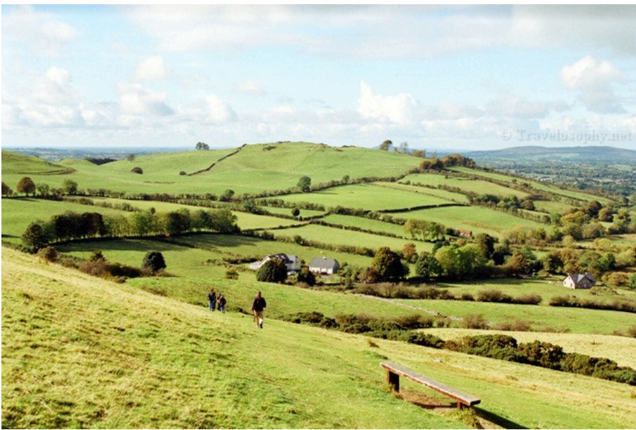
Descending Loughcrew valley view