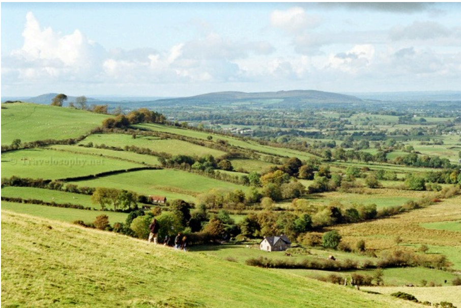
Sliabh na Caillí – surrounding hills & valley

A Picture Journey of Loughcrew Megalithic Passage Tombs , Carnbane East, Sliabh na Caillí, Co. Meath, Ireland. 06 Oct 2012. Camera: Nikon F90X with Nikon 28-85mm AF lens.