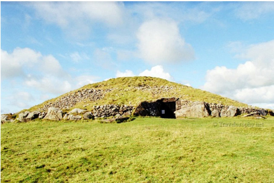
Cairn T – Cairnbane East