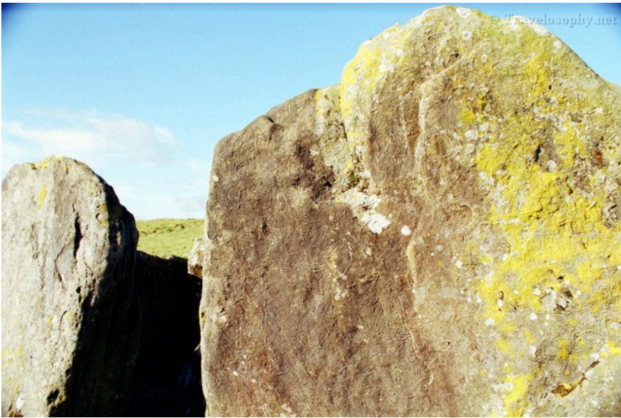
Fossilised Stone at Cairn U