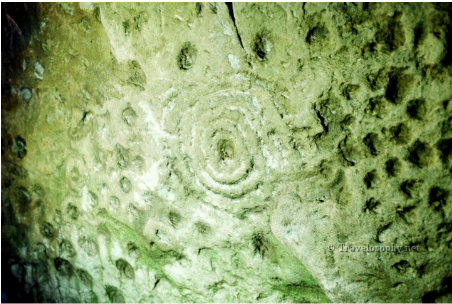
Carved Stone Close-up