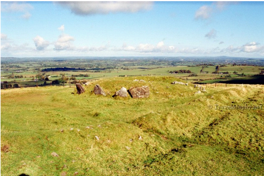
Cairnbane East & County Meath Landscape