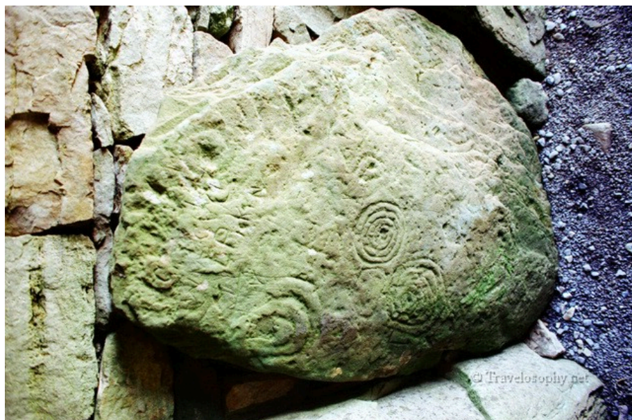
Cairn T – Entrance Passage Stone