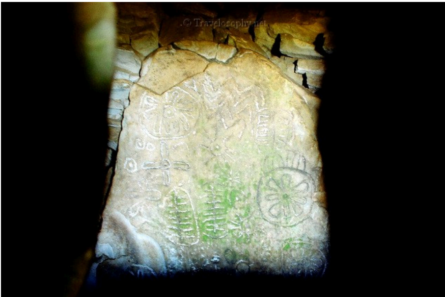
Backstone – Ciarn T – Loughcrew