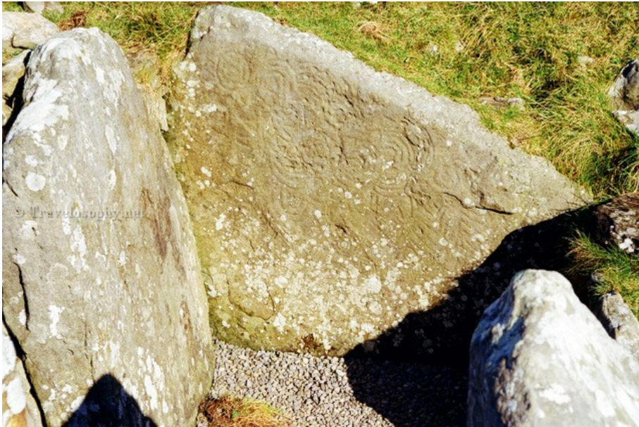
Cairn U Stone Carvings