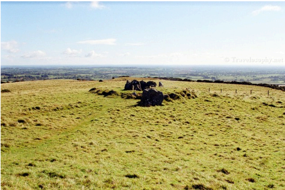
Cairn U – Distance View