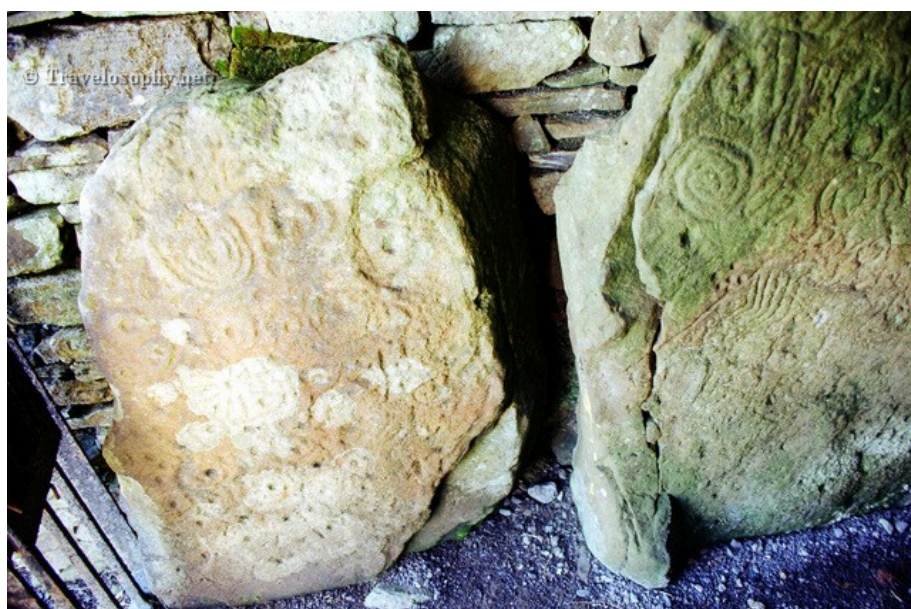
Entrance Passage Stones