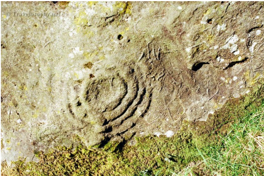
Circles in Fossilised Stone