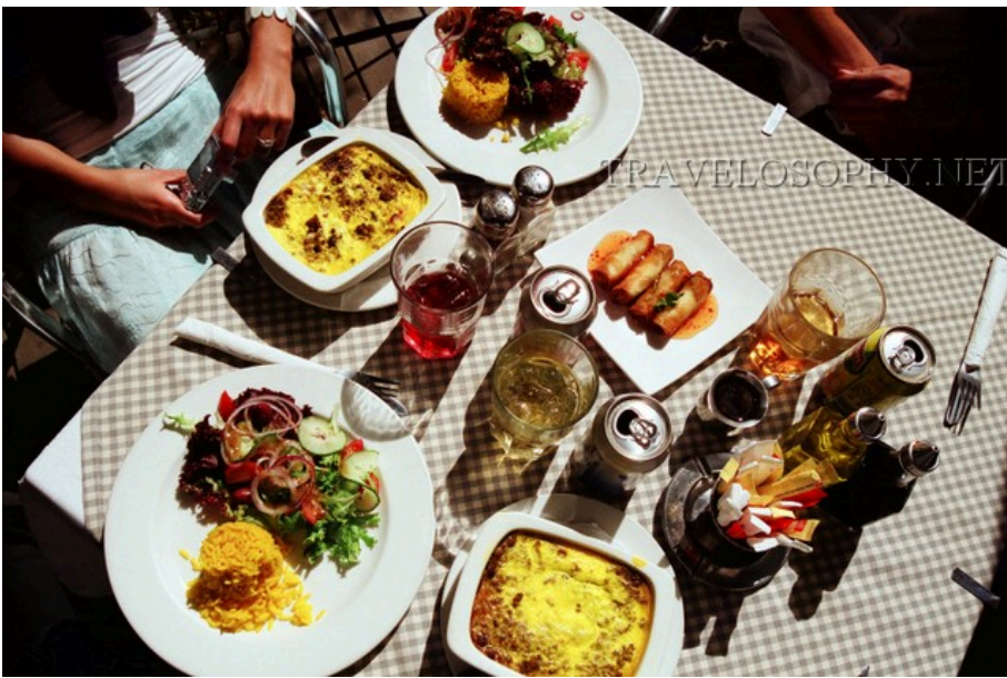
Lunch in Franschoek – Bobotie & Salad

March 2009, Cape Town, South Africa.