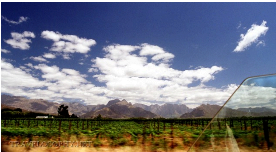
Vinyards and Clouds