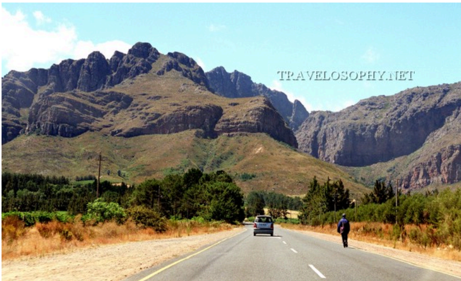
Between Somewhere and Nowhere