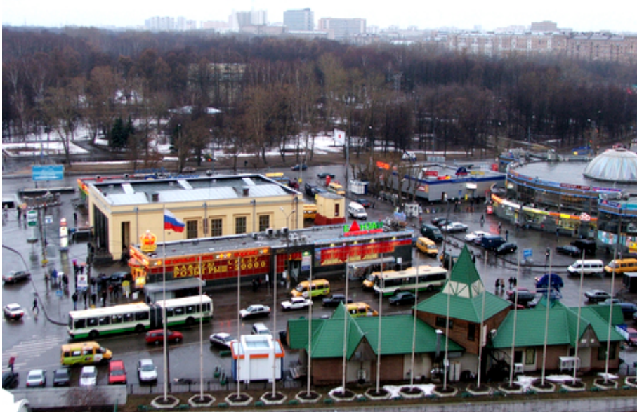
Izmaylovo Park view from Alpha Hotel