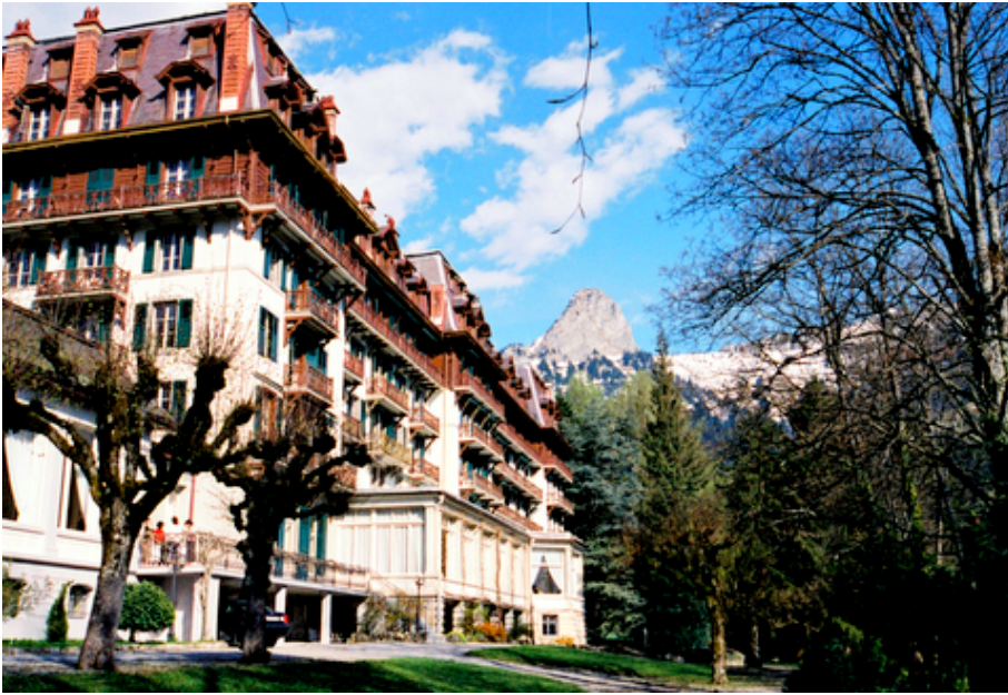
Lodge – Les Avants, Switzerland