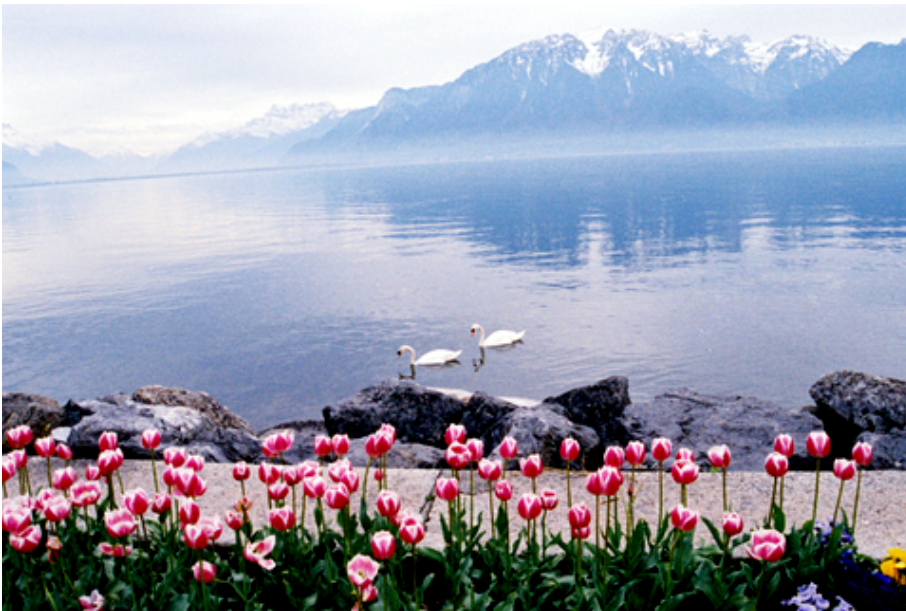
Swans on Lake Geneva