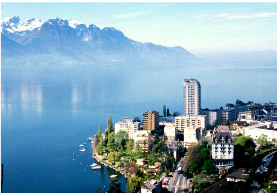
Montreux on Lake Geneva