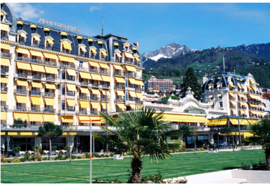
Montreux Palace Hotel, Swiss Riviera