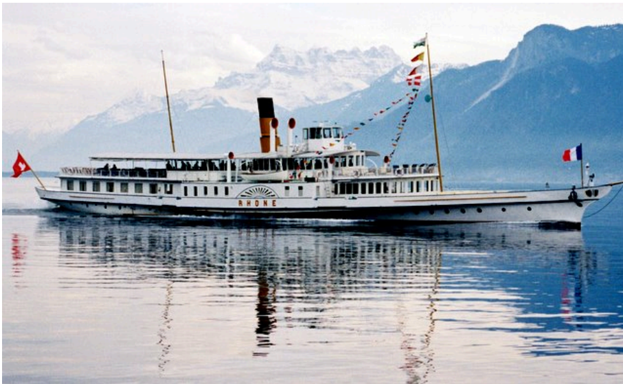
Incoming River Boat, Vevey, Lake Geneva

So what brought me back? Well, my visit to Zurich and Lucern the year before was so good, that I made a point of returning. This time I decided to head for the Swiss Riviera, which includes Lausanne, Vevey and Montreaux along the North Easy shore of Lake Geneva. I chose Vevey as my base during my stay. Of the three cities, Vevey is the most tranquil and has a very quaint atmosphere with of course a very French flavour. The lake-side area has snow capped peaks as a backdrop, with river boats passing by and a relaxed, not crowded promenade. Amongst other famous people who frequented this area, Charlie Chaplin actually settled in Vevey and is buried in a local cemetery.