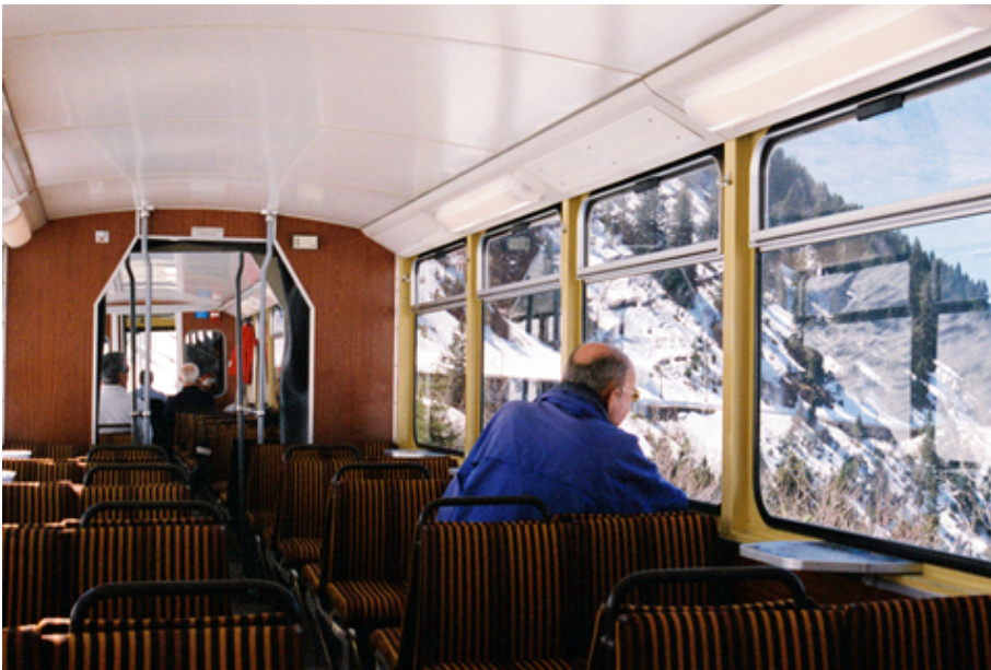
On the way from Rochers-de-Naye