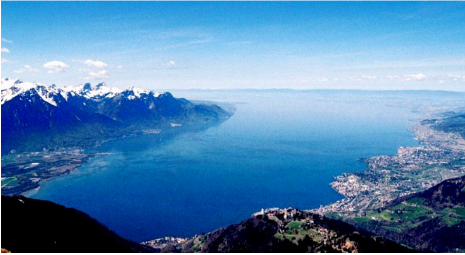
Lake Geneva Panoramic Platform View