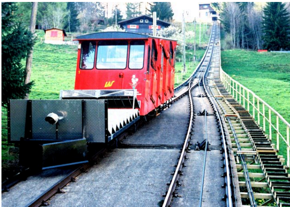
Sonloup Funicular from Les Avants

Photographs by Jean-Jacques M during a visit to Montreux and surrounds. Switzerland, May 2005. Camera: Nikon F65 with 28 – 80 Kit lens & Fuji ISO 200 Film.