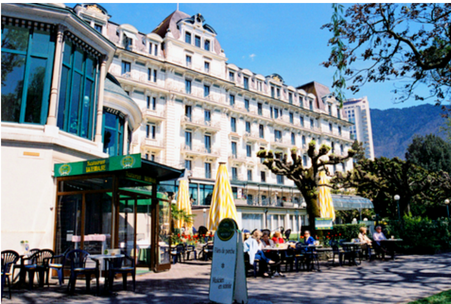
Hotel and Cafe, Montreaux Promenade, Lake Geneva

Montreaux, famous for its Jazz Festival was my destination on my second day and as a bonus, early summer launched itself in full glory! I was not disappointed. It's a true Riviera city and very vibrant , but not as large as one might expect .The lakeside and busy promenade have an abundance of flowers, including lots of tulips, with trees, small parks and open area restaurants. As everywhere around the lake, the Alps again provide a backdrop. The fact that it's a playground for the rich and famous is very apparent with all the trappings that one might expect. A very appealing city to visit in so many ways.