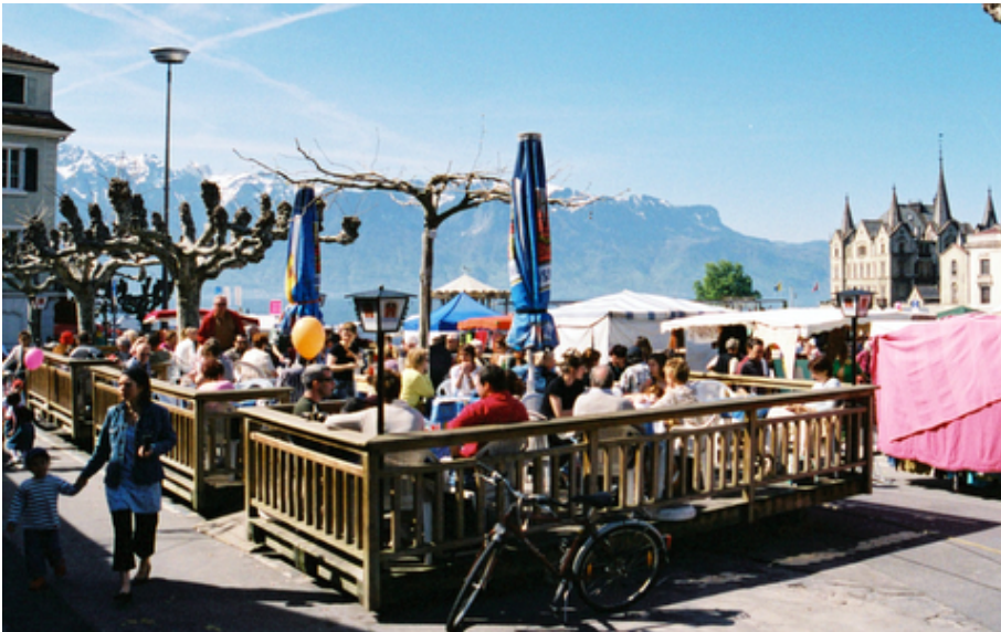
Outdoor Café, Vevey, Lake Geneva

On my final day I enjoyed the Saturday food market in the Vevey town square, before heading off to Lausanne, Switzerland's third largest city. It was bigger than I expected and a bit too busy after spending time in the other two slightly more tranquil resorts, but it's a very attractive city none the less. The Dolce & Gabana, Prada and Gaultier crowd was out in full force, striding the sidewalks and blowing Swiss Franks in the boutiques and malls. I made a quick visit to the lake side area, but after about three hours decided to head back to Vevey. My legs were giving me a bit of 'uphill' due to my mountaineering of the day before and I returned to my pleasant youth hostel in Vevey for a relaxed evening with fellow travelers, before preparing for my departure to Poland the following day.