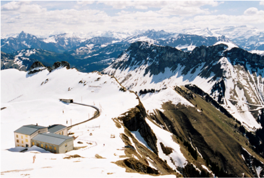
Rochers de Naye Station

snow with another fifty meters or so of climbing to reach the lookout platform. From there one had a magnificent 180 degrees view of multiple rugged layers of snow capped Alps. The other 180 degrees gave a brilliant view of Lake Geneva, here known as 'Lac Lemman' and on a clear day as the one we had, one can see a vast section of the valley, its villages and the lake.