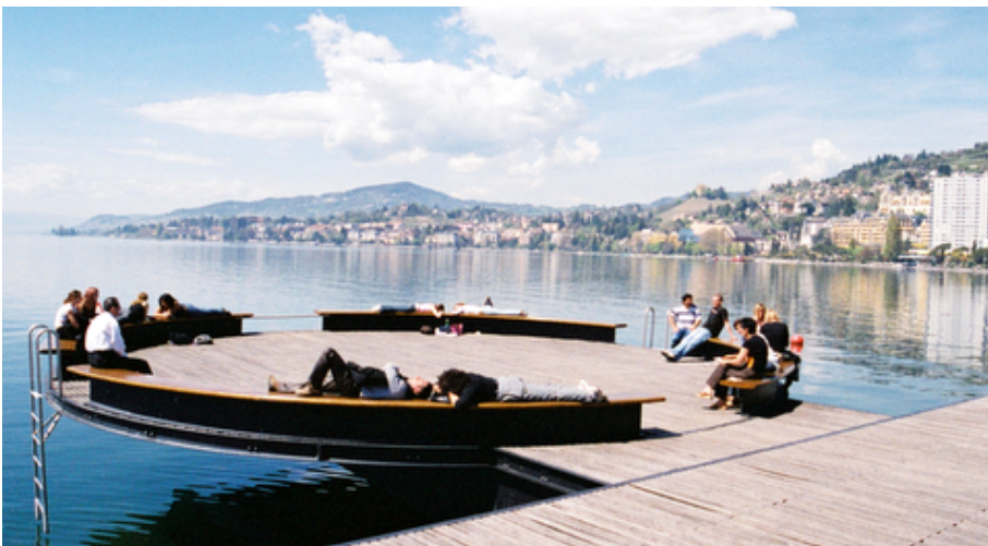
Spring Sun Siesta, Montreaux Promenade