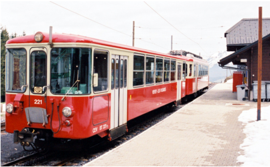
The Star Cog Train, Les Pleiades

Montreaux, famous for its Jazz Festival was my destination on my second day and as a bonus, early summer launched itself in full glory! I was not disappointed. It's a true Riviera city and very vibrant , but not as large as one might expect .The lakeside and busy promenade have an abundance of flowers, including lots of tulips, with trees, small parks and open area restaurants. As everywhere around the lake, the Alps again provide a backdrop. The fact that it's a playground for the rich and famous is very apparent with all the trappings that one might expect. A very appealing city to visit in so many ways.